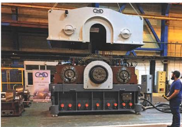
Jumborex NEO opening in 30 sec.