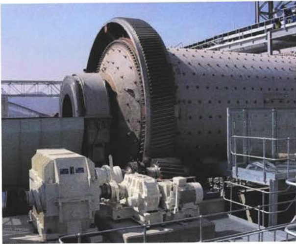
Typical layout of a lateral drive horizontal mill.