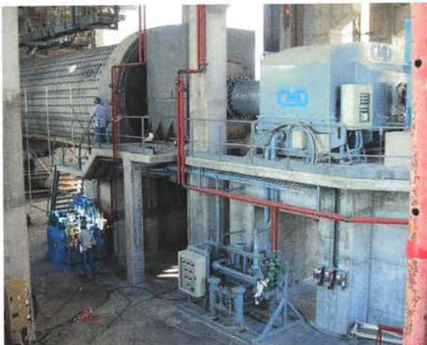
Typical set up of central drive ball mill

The benefits of this central drive design compared to lateral driven mills are, amongst other things, a reduction in equipment (there is no girth gear, pinion, girth gear cover, etc.), which makes the solution more reliable and easier to maintain. It also decreases the volume of lubricant used because the lubricant is recycled in the closed loop gearbox. The maintenance cost is therefore reduced.